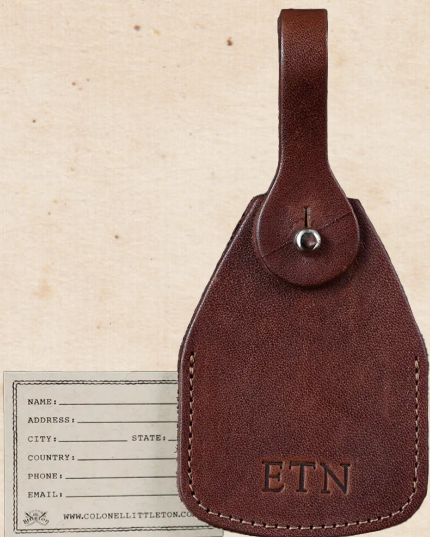
No. 14 Luggage Tag An upscale travel accessory.

Thank your employees or clients at the end of a successful quarter, business deal or big conference with an affordable high-quality gift.