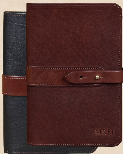
No. 20 Travel Portfolio Perfect for jotting notes on-the-go.