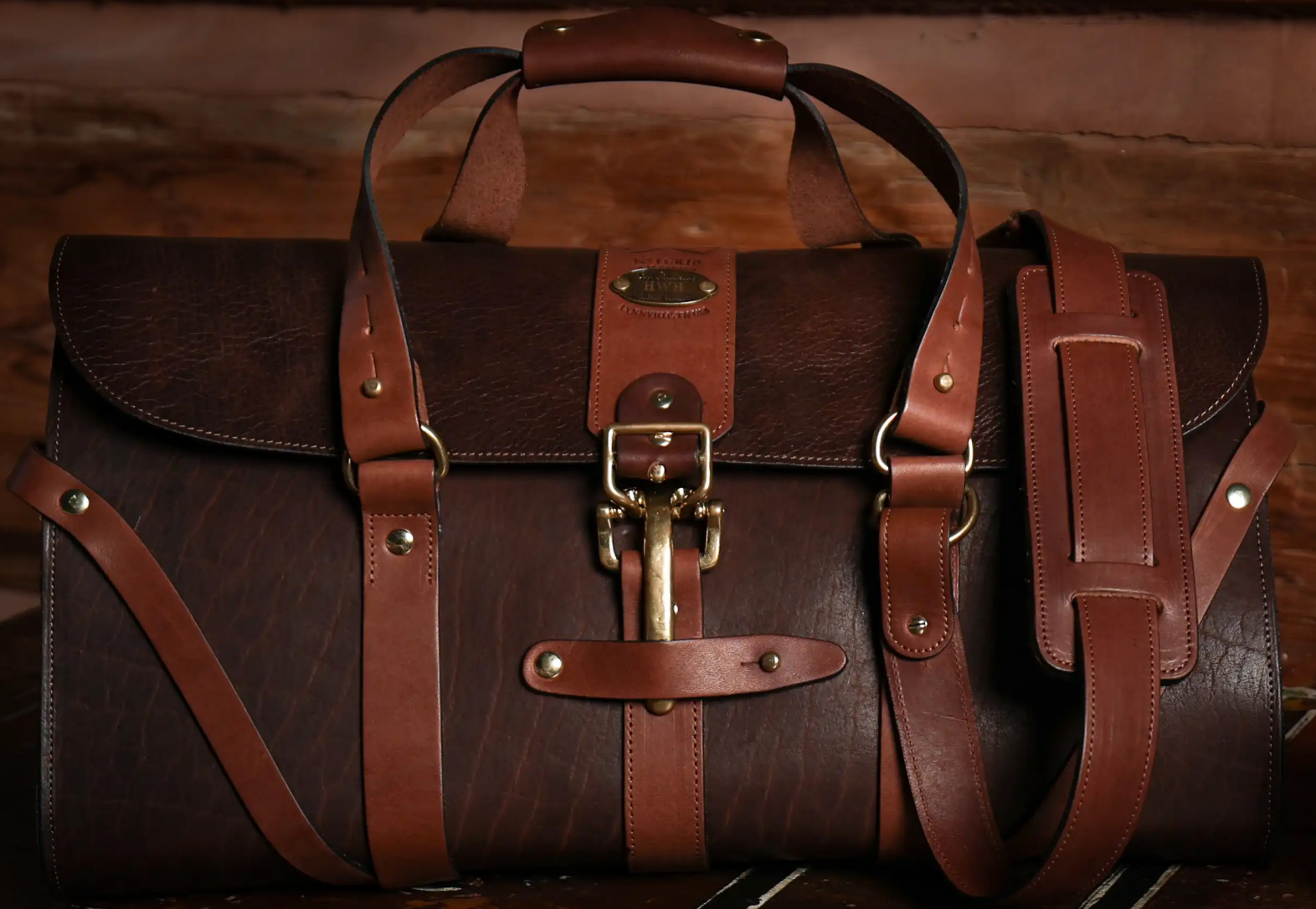
No. 1 Grip Bag