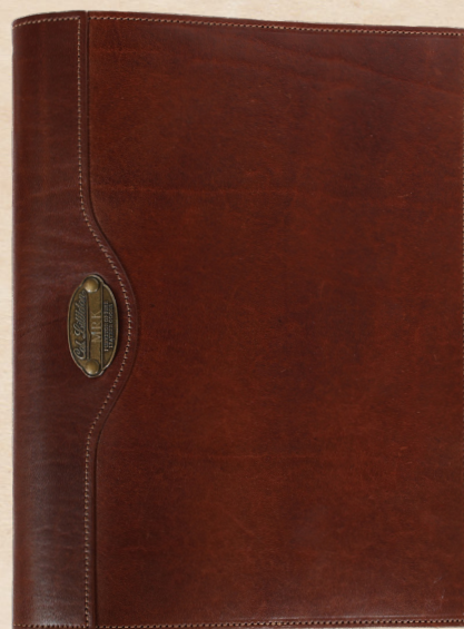
No. 30 Composition Journal Perfect for note takers and list makers.