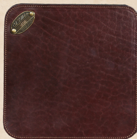
No. 3 Mousepad Superior quality to enhance your office decor.