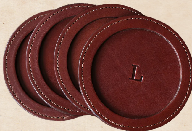
Leather Coasters A statement in the home or office.