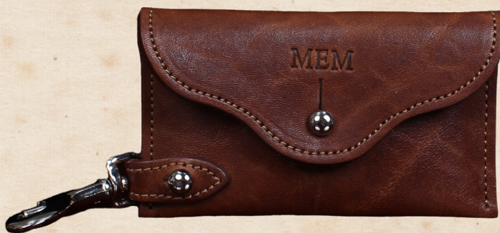
Leather Key Wallet Carry your keys and basic necessities.