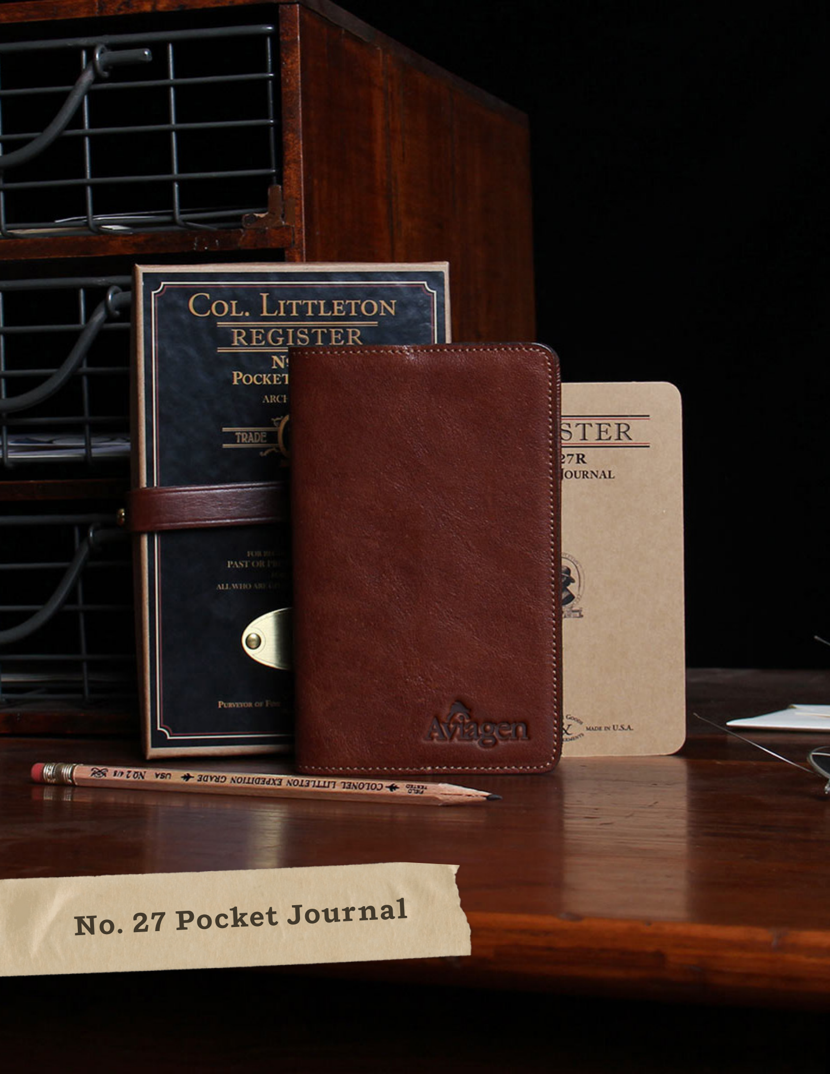
No. 27 Pocket Journal