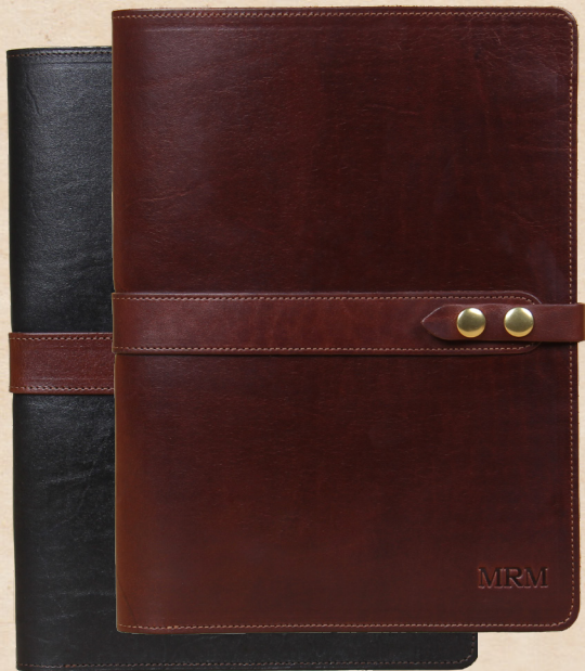
No. 18 Leather Portfolio Our best-seller since the very beginning.

The gift of handcrafted leather adds a touch of timeless sophistication to any workspace.