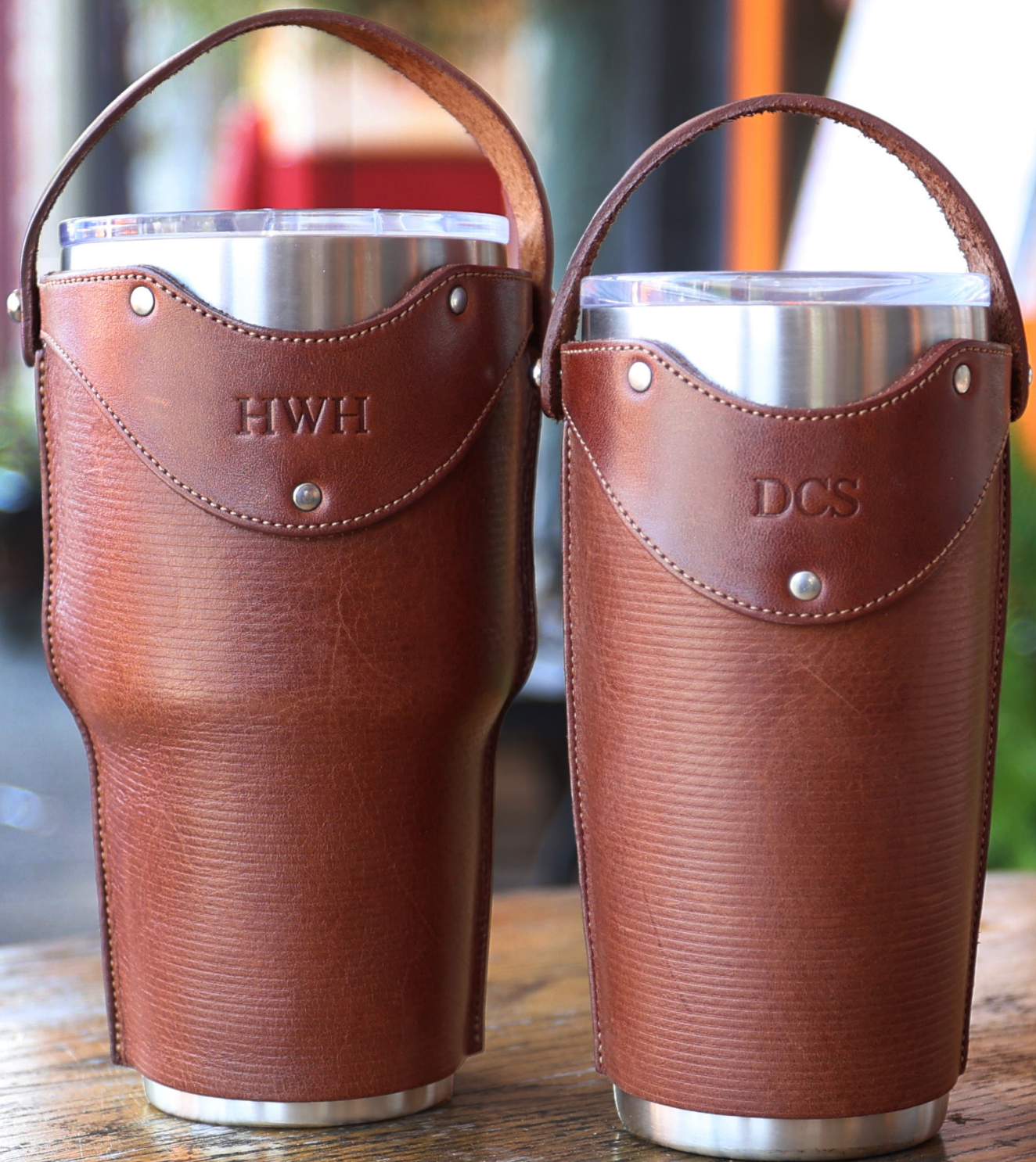
Traveler Tumbler Sets